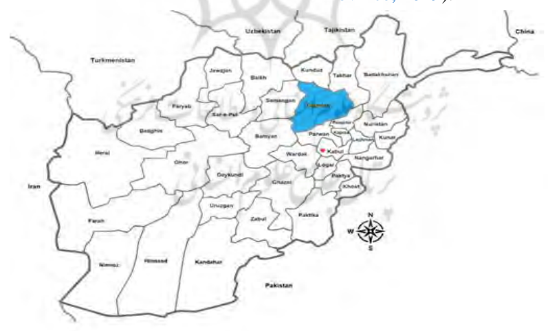
Figure 1. Map of Afghanistan and the study area

The area studied in this research was Baghlan Province. Baghlan Province is one of the important agricultural provinces industrial and Afghanistan. Baghlan is located 230 km from Kabul along the Kabul-Mazar-e-Sharif highway. This province is a part of the northeastern provinces and connects eight Northern provinces of the country with the capital of Afghanistan (Kabul). The main agricultural products of this province are wheat, rice, melons, turnips, cotton, potatoes and onions. The area of this province is 21112 km2. The population of Baghlan Province is about 1,053,200 people (Profile of Baghlan Province, 2019).